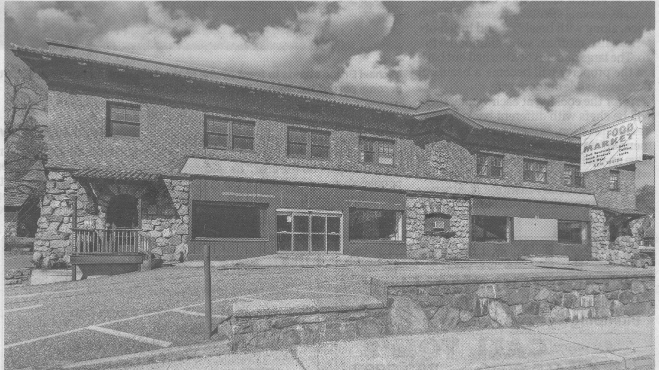
The old IGA Market in Tuxedo will be completely renovated and become the Tuxedo Hudson Company Market, with lots of local Hudson Valley food and products for sale.

"I'd love to have it done by the end of summer, and we're going to push really hard for that. We would have had it done in three weeks if I had just stayed on plan," he chuckled, "but the end result is going to be so pretty."