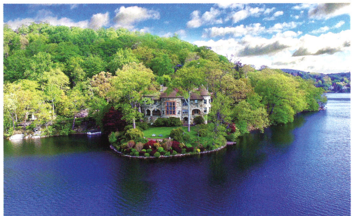
79 Turtle Point in Tuxedo Park, New York—which is situated on three acres on Tuxedo Lake—is on the market for $6.25 million.

Frequently, buyers are from New York City; Bergen County, New Jersey; The Hamptons; the West Coast; and Canada. The truth is, they’re from all over the country.