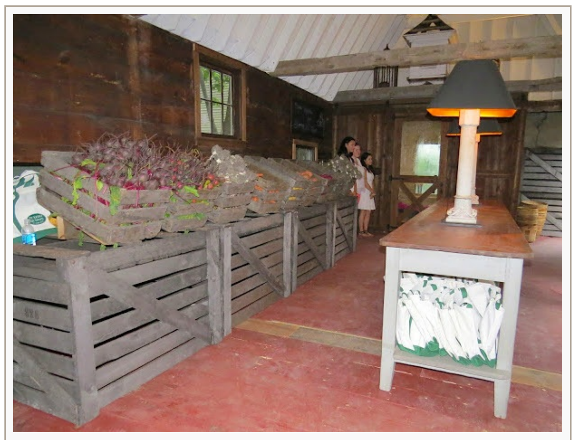
Inside the old Blue Barn, a new farm stand concept that will become part of the French Resistance Cafe.