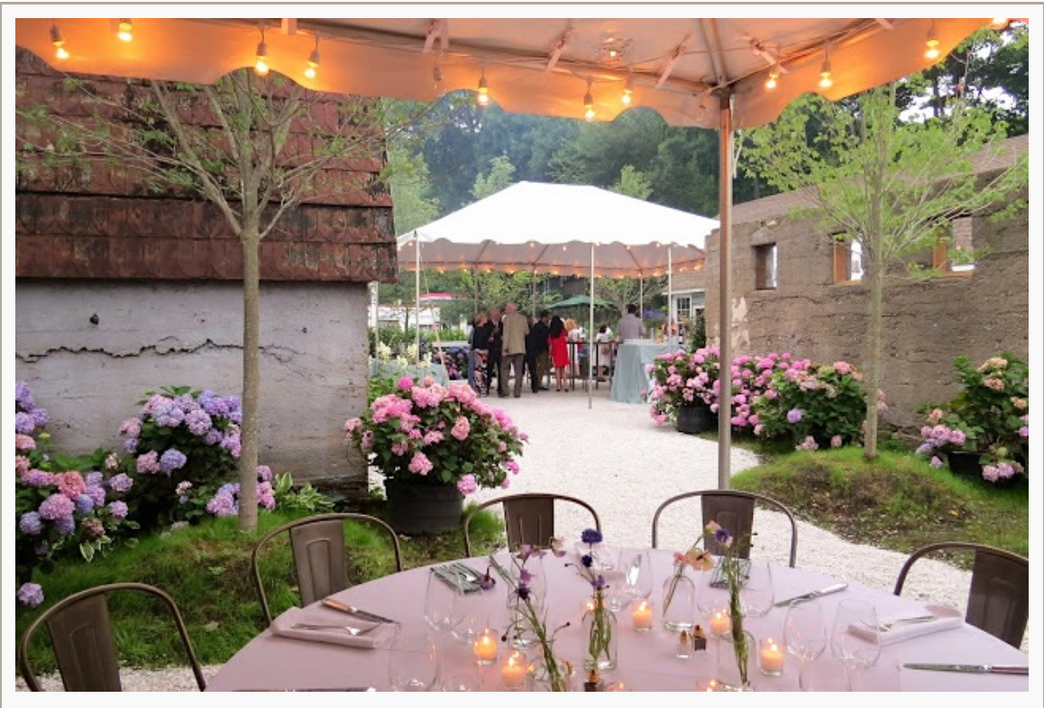
View of the grounds at the French Resistance Cafe in Sloatsburg — from the garden looking out toward the entrance. The evening's event was planned and catered by Heather Bullard + Tuxedo Park Events.

The expansive grounds were decorated in newly planted foliage and included three separate areas — open barn building, Rose Courtyard and sprawling gardens — which completely transport visitors into a different place, away from the buzz of Route 17 and into a welcome respite. Bruno's vision of a little Hamptons in the Ramapo Mountains of Sloatsburg is off to a good start.