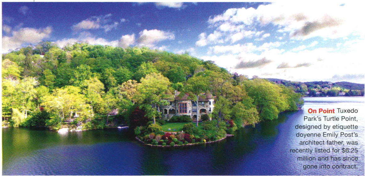
On Point Tuxedo Park's Turtle Point, designed by etiquette doyenne Emily Post's architect father, was recently listed for $6.25 million and has since gone into contract.

Some luxury condo buyers "are coming from properties within an eight-mile radius, with large acreage, pools, and tennis courts"