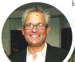
Mark Badgley Fashion Designer

grand. Perfect for downsizers, a Mediterranean villa in Oyster Bay Cove that's currently owned by fashion designers Mark Badgley and James Mischka is an especially attractive option for older buyers, as three of its four bedrooms are located on the first floor. The residence, which opens onto a raised rear courtyard, is