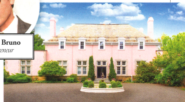
Pink Elephant? Topridge, a dreamy Delano & Aldrich-designed mansion in Tuxedo Park, is on the market for $4.25 million.