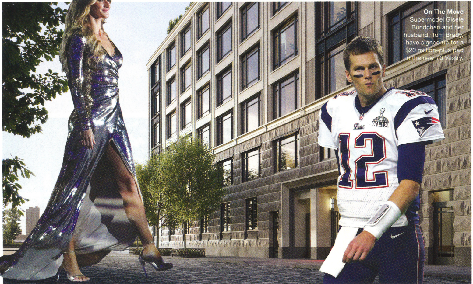
On The Move Supermodel Gisele Bündchen and her husband, Tom Brady, have signed up for a $20 million-plus pad in the new 70 Vestry.

THE INSIDE SCOOP ON NEW YORK REAL ESTATE