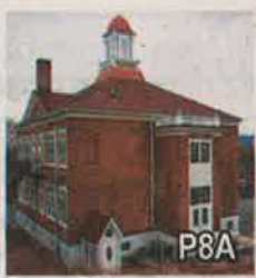
ROSE MEMORIAL LIBRARY WINS ARTICLE 78