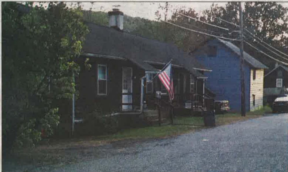
Homes along Lake Street, a quiet dead-end street in the Hamlet of Ramapo