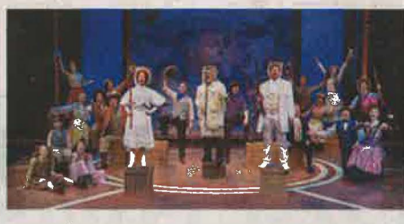
"ANNIE, GET YOUR GUN" A SURE SHOT WINNER AT WESTCHESTER BROADWAY THEATRE