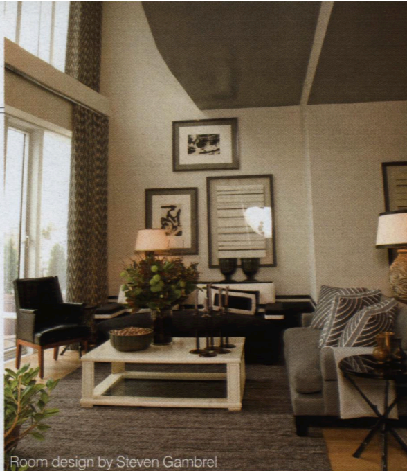
Room design by Steven Gambrel

HOW: Pieces in each room are for sale, as are the residences themselves—either fully furnished or bare. Visit 1stdibs.com .