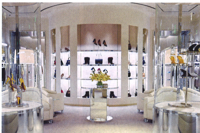
From left: Salvatore Ferragamo's Beverly Hills flagship. The new Deco-inflected interior by Studio Sofield.