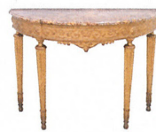
1STDIBS Eighteenth-century Italian table, £12,123