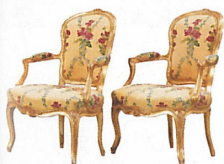
BARNEBYS Eighteenth-century Swedish armchairs, £2,000-£3,000