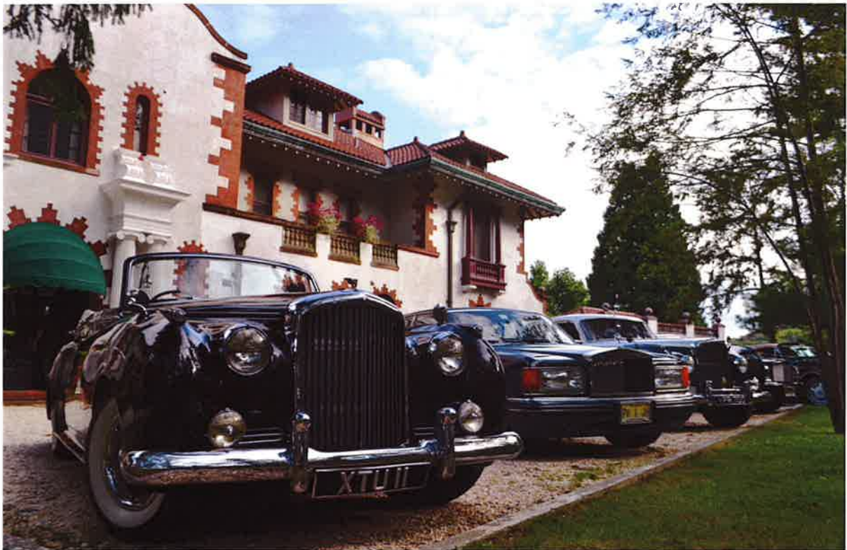
Above: "The Hacienda" home of the Regna's with a sampling of members' cars.

The veranda was the perfect place to relax with friends after the long day. Some members commented that the view of the lake was as good, if not better, than Lake Como, Italy.