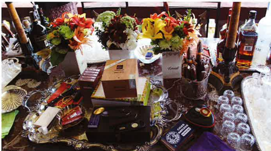
Left: The After Party.