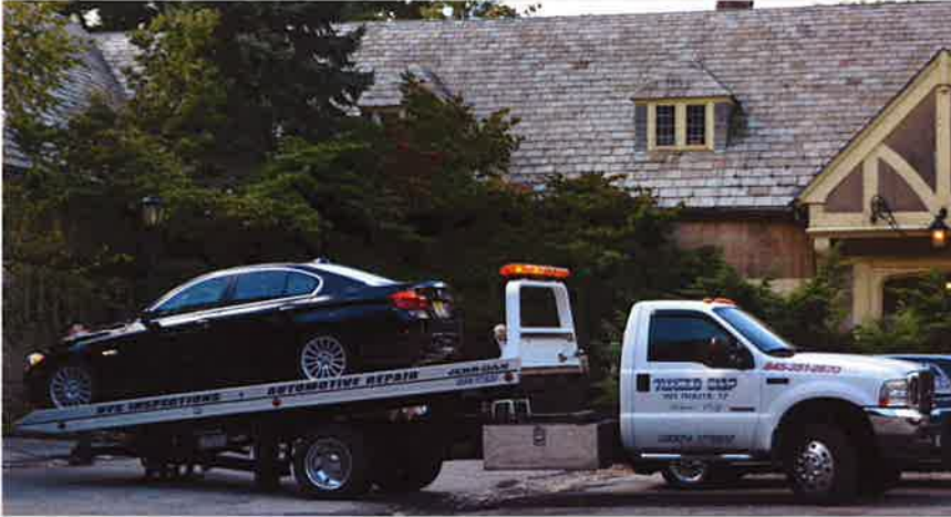
Left: A BMW is towed from the parking lot to make room for our PMCs.