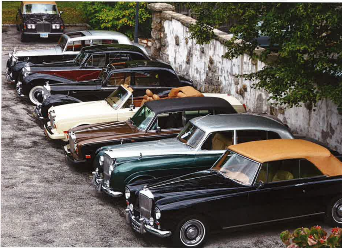
Above: A partial line up of motor cars at the Gates and Estates 2013 event.