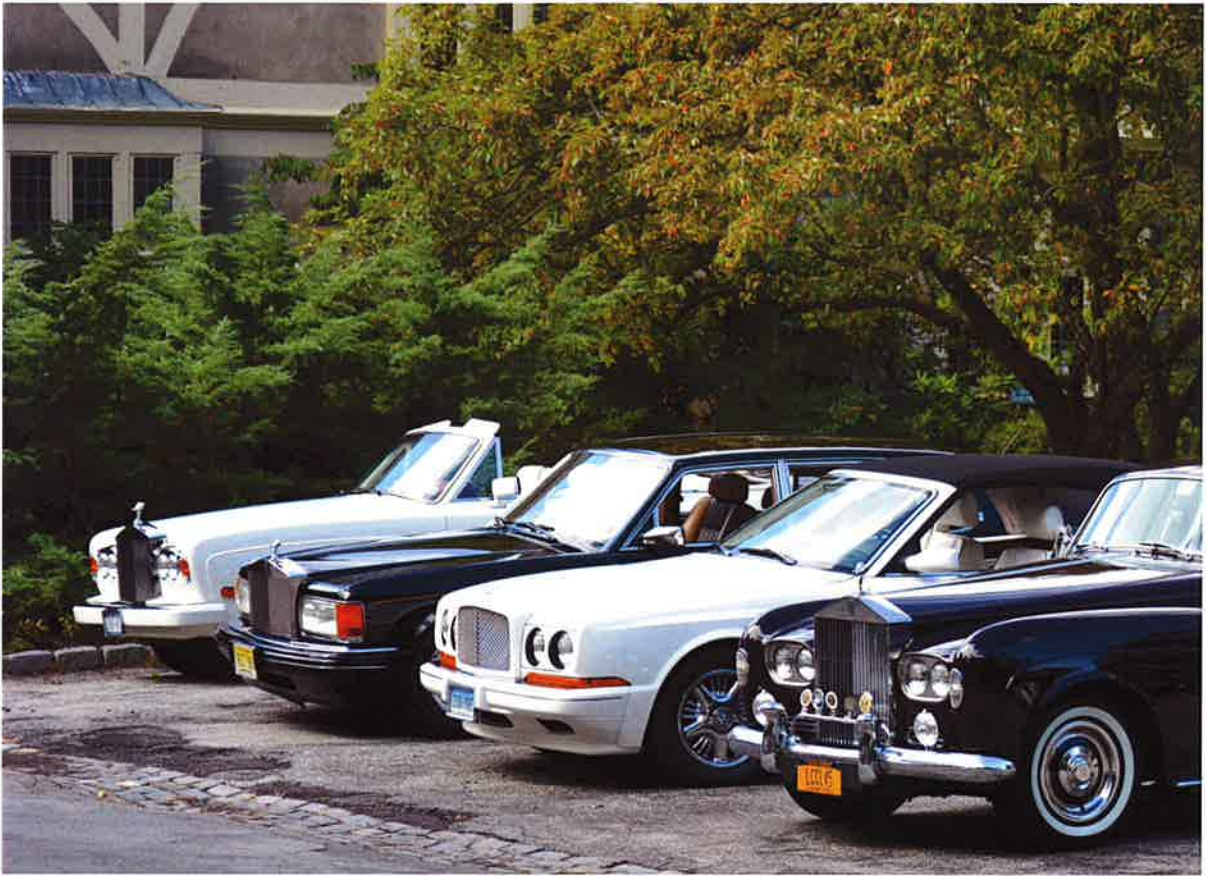
Above: Sunday Best.