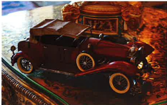
Above: Villa Regna décor.