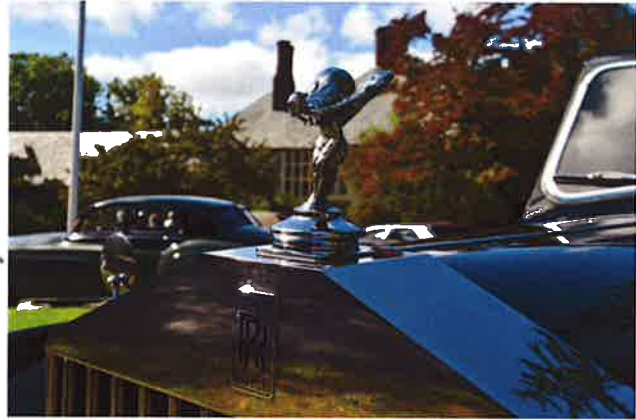
Above: Outside the Tuxedo Club.