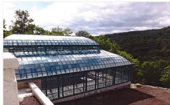
Above left: The El Rayess Residence. Above right: The pool was a showstopper.