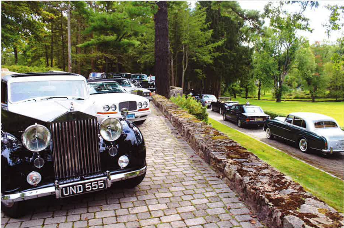
Above: Forty PMCs lined the Bruno House driveway.