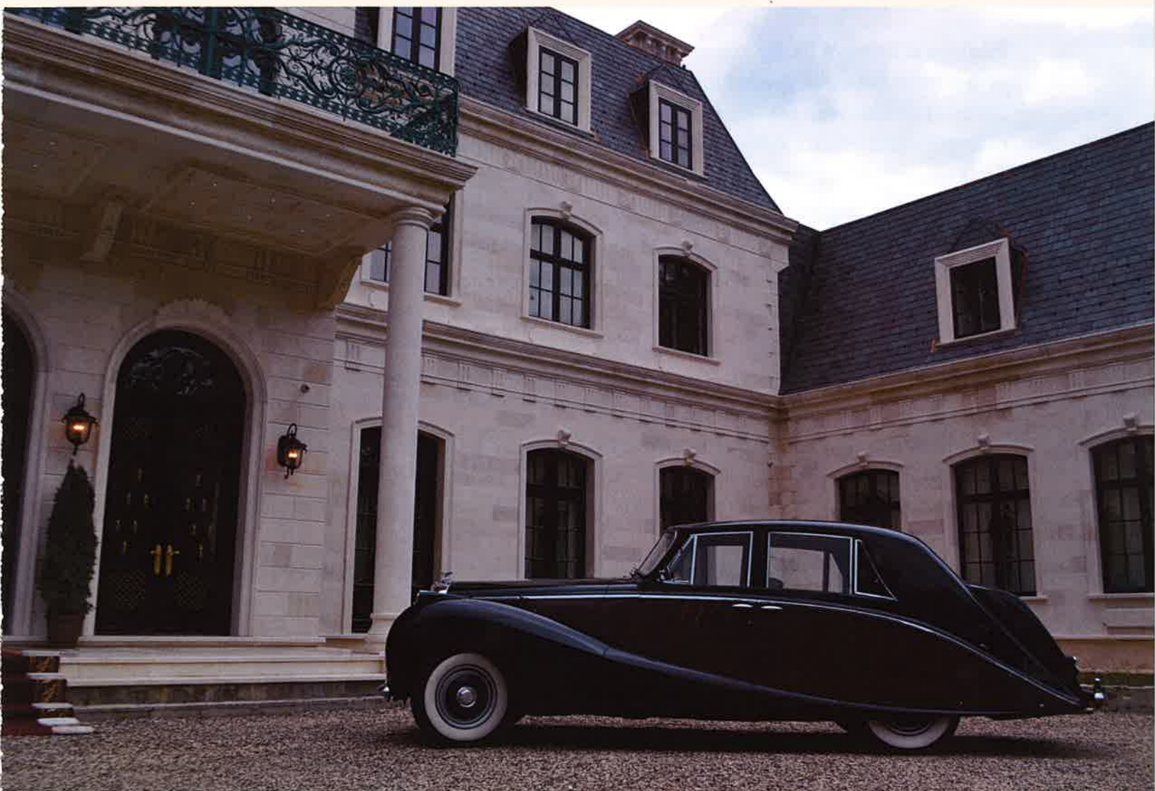
Above: Elegance and beauty personified.