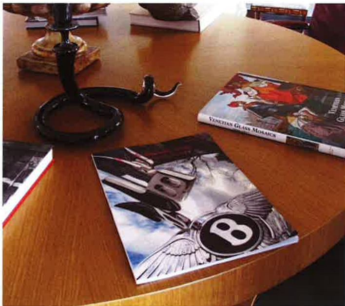
Left: On display at the Bruno home!

Our hosts took great pleasure in opening their doors to us. The eclectic collection of furnishings throughout reflected a casual elegance at every turn. The view from the veranda was heavenly, as was the meadow beyond the expansive driveway where our motor cars were displayed.