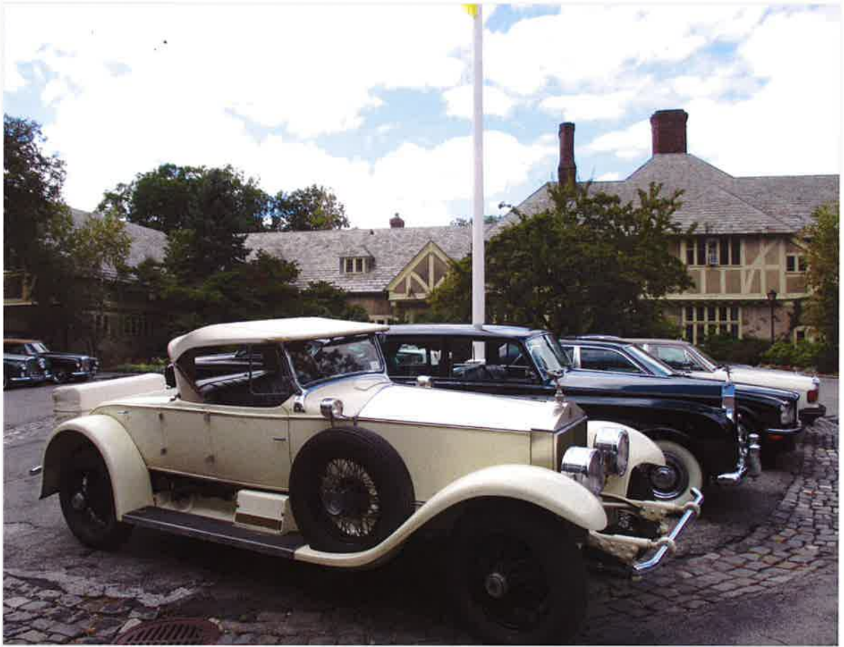
Above: Bevy of beauties outside the Tuxedo Club.