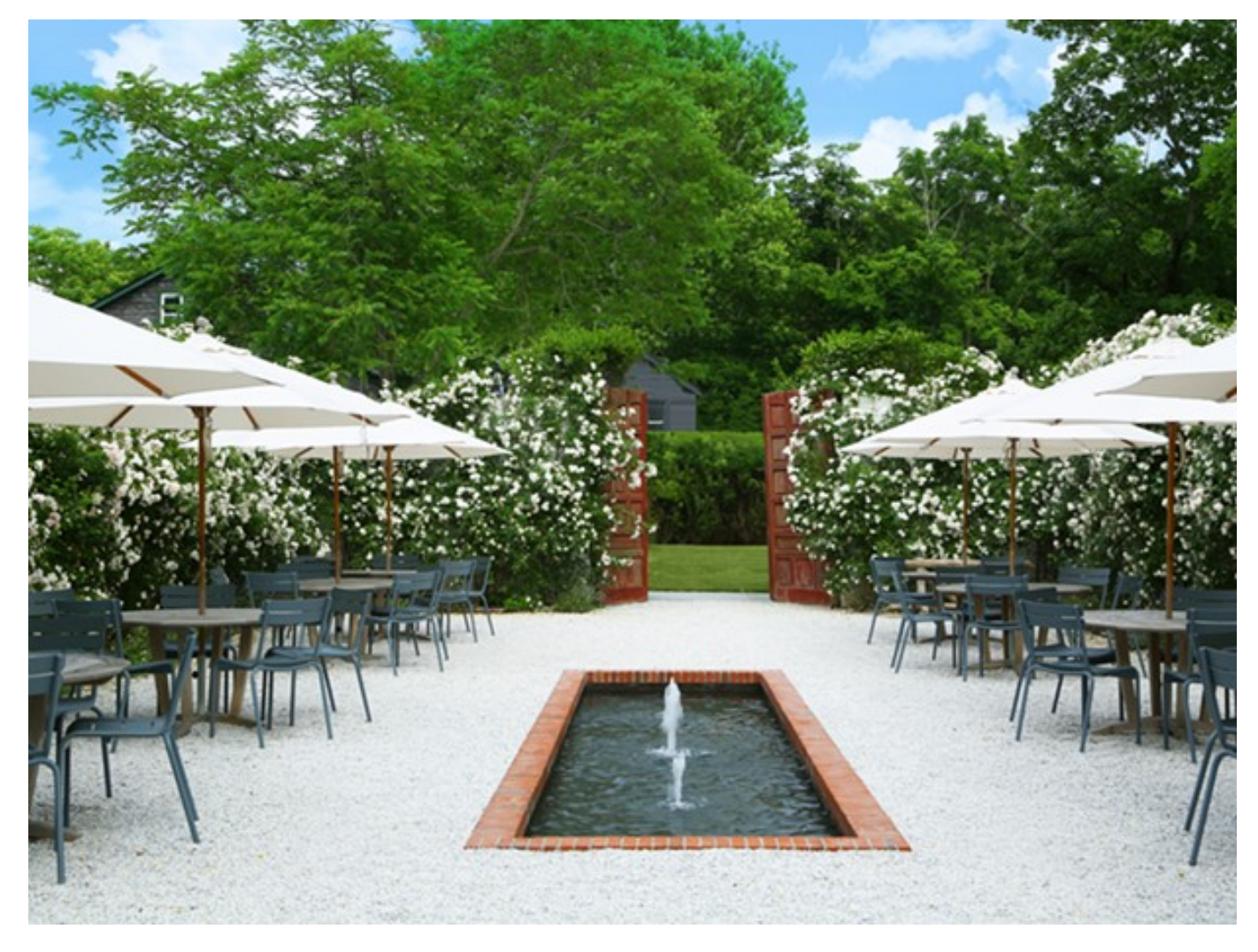
The Rose Garden at Valley Rock Inn.

A secluded Sloatsburg sanctuary surrounded by acres of wild reserves, the Valley Rock Inn and Mountain Club is a rustic refuge that arouses the intimate atmosphere of a far-off village. Anchored by acres of preserved wild land across Harriman State Park and Sterling Forest, the luxurious expanse of cloistered quarters offers an idyllic outdoor weekend wedding retreat fueled by fresh farm-to-table produce. With access to an array of amenities onsite, friends and family can gather inside historic dwellings, barns, and meeting houses that date back to the early 19th century, while an assortment of accommodations for up to 250 wedding guests are available.