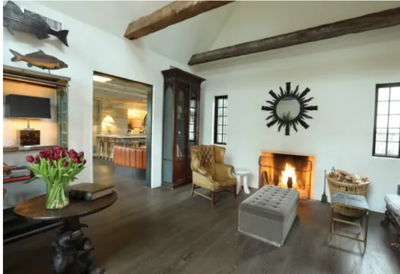
The entrance to The Lodge at The Valley Rock Inn in Sloatsburg; photographed Feb. 18, 2020.

"We're always mixing it up," he said, "which I think adds an element of surprise and fun."