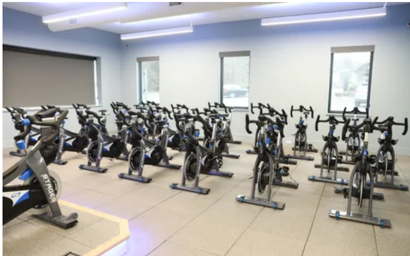
The Valley Rock Inn Fitness Center in Sloatsburg is housed in the village's former post office. Photographed on Tuesday, February 18, 2020.

Currently, the Valley Rock Inn, has four guesthouses consisting of 17 bedrooms and 16 baths spread among what are known as "the Waldron Houses," which date to the mid-1800s. According to the inn's website, each room features a spacious living room with a 60-inch-connected to Pandora TV, a wet bar, Frette linens, down pillows and comforters. Guests have access to an entire refurbished home with smart technology and, in most cases, a covered porch with room to entertain (or just relax).