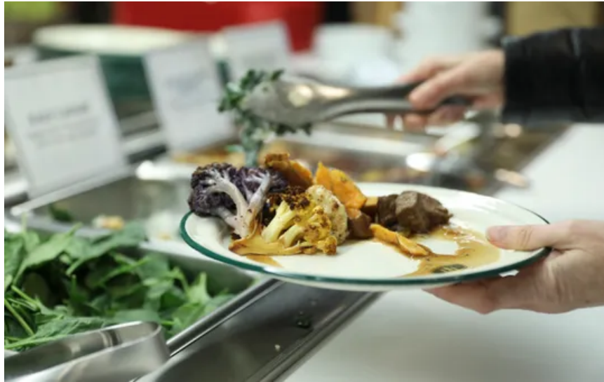
Stocking up on lunch at The Mountain Market Cafe & Provisions, part of The Valley Rock Inn, in Sloatsburg on Tuesday, February 18, 2020.

The Lodge is open (for now) from 4 to 10 p.m. Thursday to Sunday, with Sunday brunch from 10 a.m. to 3 p.m.